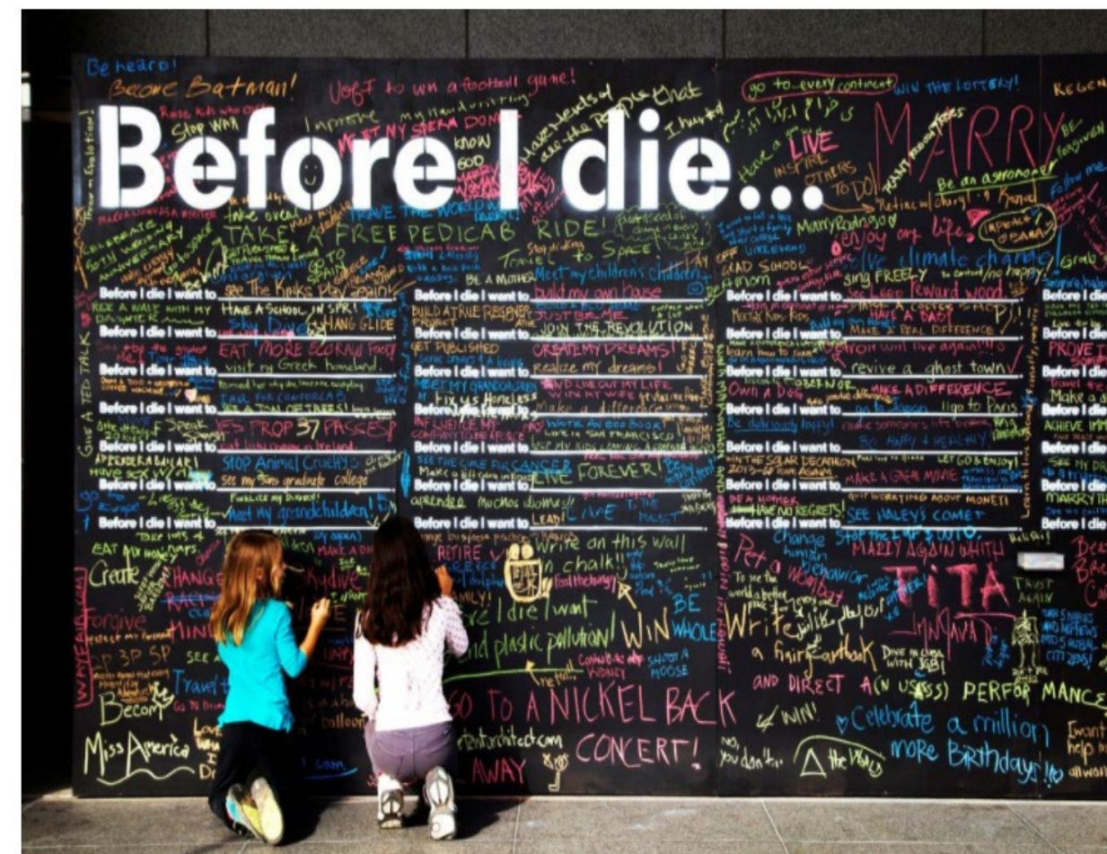
San Francisco, USA.

Ethical approval was obtained from the Flinders University Research Ethics Committee (Project 7247).