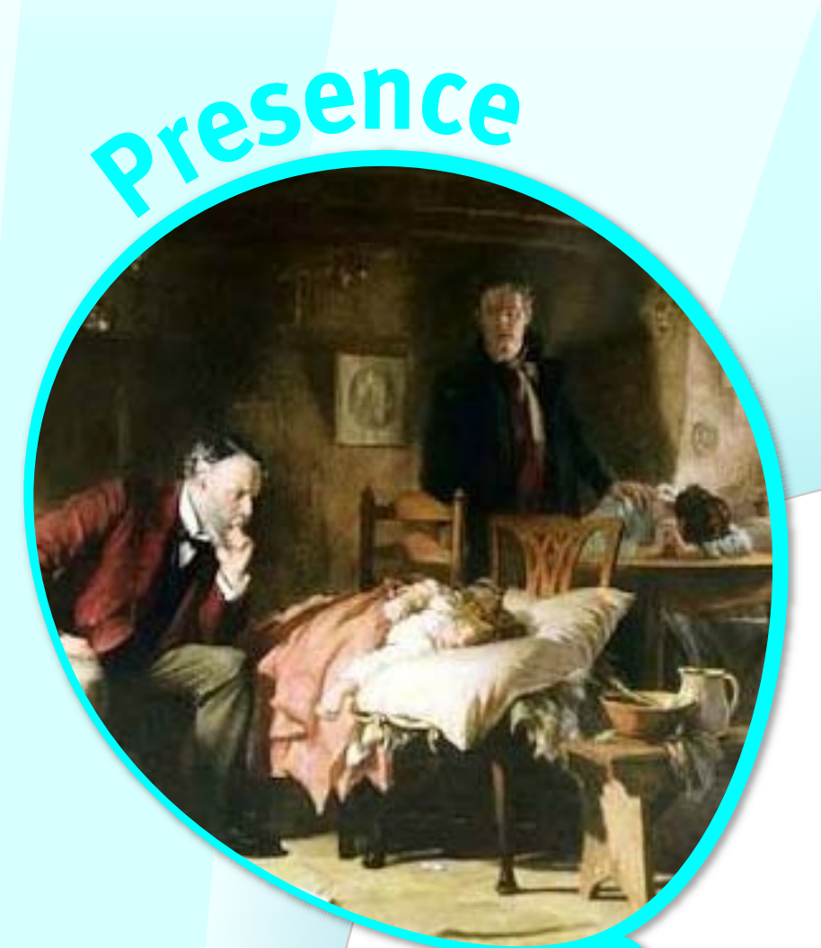
"Sometimes we need someone to simply be there. Not to fix anything, or to do anything in particular, but just to let us feel that we are cared for and supported" - Unknown