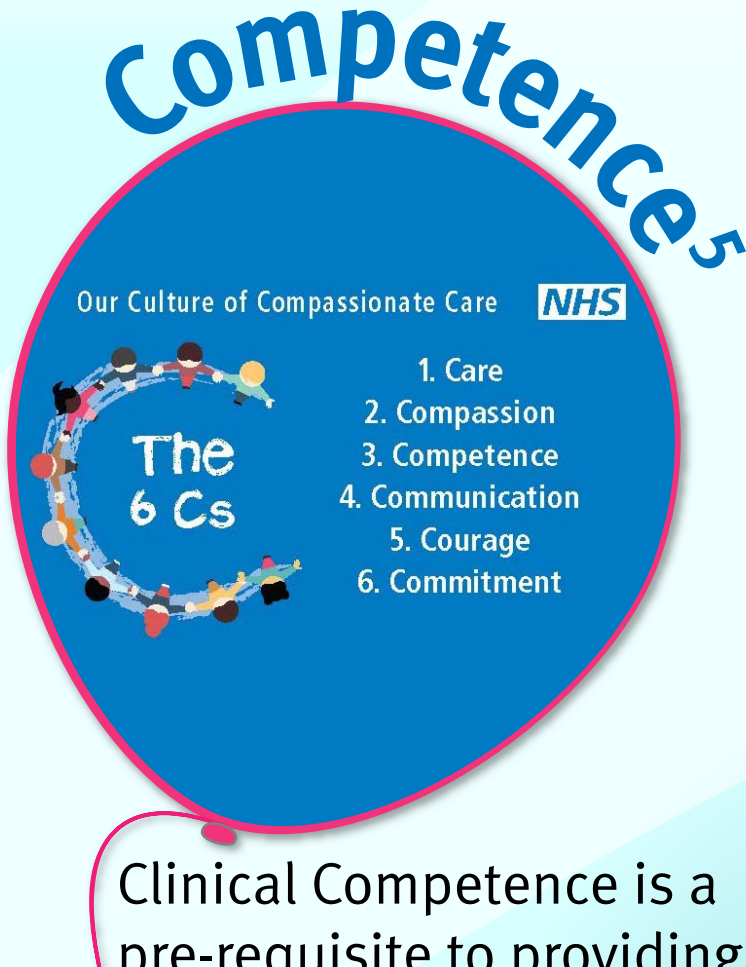
pre-requisite to providing